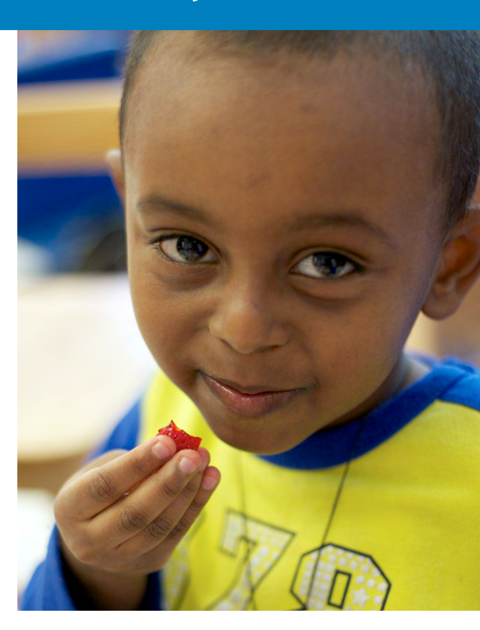
Compiled from Brush Up on Oral Health