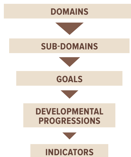
FIGURE 1: FRAMEWORK ORGANIZATION

Each domain is related to and influences the others. For example, as preschoolers' working memory develops (a component of Approaches to Learning), their ability to follow multiple-step instructions improves, and their ability to learn complex math concepts increases.