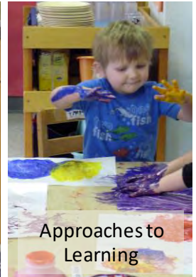
Approaches to Learning

Art projects provide opportunities for children to experiment and solve problems, while music helps children learn math skills like pattern detection.