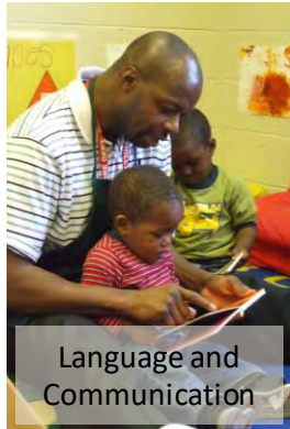
Language and Communication

Through song, dance, drawing and painting, children learn how to relate to each other and themselves and how to better express their emotions.