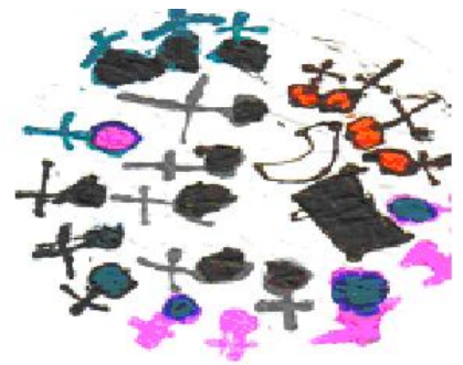
Flowers with watercolors, "The flowers are in a circle" (in Mandarin) (4/4)