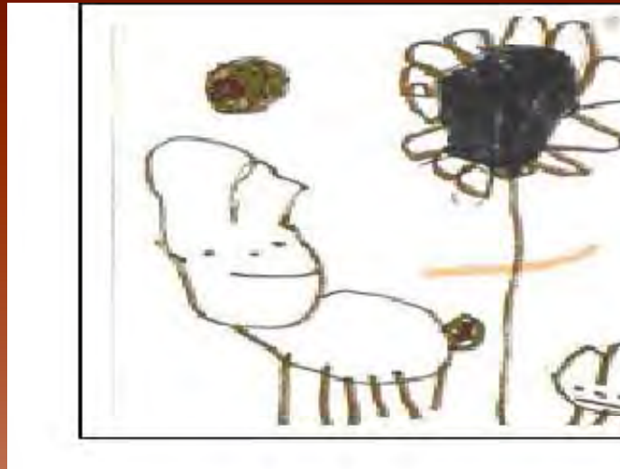
Flower with markers, "The bunny and the flower" (4/3)