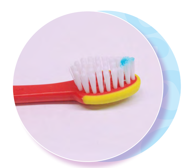
Use a smear for children under age 3.