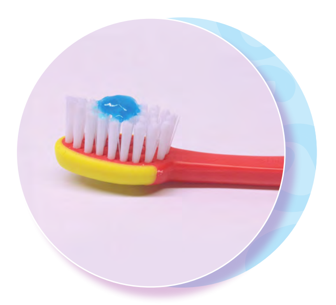
Use a pea-size amount for children ages 3 to 6.

This handout was prepared by the National Center on Early Childhood Health and Wellness under cooperative agreement #9OHC0013 for the U.S. Department of Health and Human Services, Administration for Children and Families, Office of Head Start.