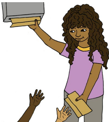
Paper Towel Passer