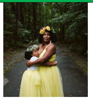
Image Reflection: Write down some strengths you observe in this image.